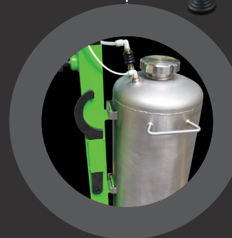
1. Sprays using compressed air