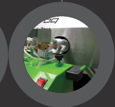
3. Adjustable nozzles and fixating arms